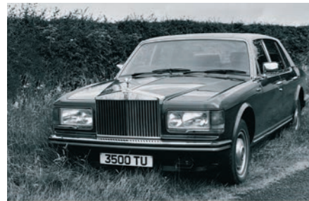
The Everflex roof was an option on early Silver Spirits and standard on Spurs. Headlamp wipers were replaced by high pressure jets in 1985

Milestones in the production of Rolls-Royce and Bentley SZ saloon cars