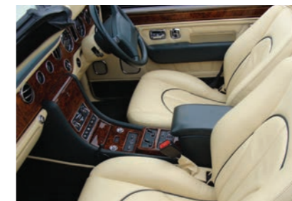
The body looks similar to that of the Silver Seraph, but the Corniche launched in 2000 (model year 1999) has its roots in the 6.75-litre SZ range. The instrument layout is based on that of the Silver Spirit, with an outside temperature gauge, no rev counter and a column mounted gear selector

Continental carried SZ numbers, as did the Continental R, T and SC