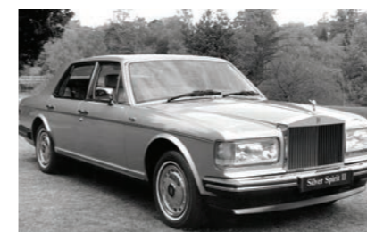
The Silver Spirit II gained alloy wheels with stainless steel trim, plus adaptive ride and improved handling. Inside, there was a new fascia with two additional bull's eye vents, inlaid and crossbanded veneers and a leather trimmed steering wheel