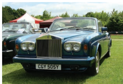
Although based on the Rolls-Royce Silver Shadow II, the 1983 Corniche badge did not include the II suffix but the car carries a 17-digit chassis number with the fourth position being a Z, thus qualifying it for SZ status

In addition to the Silver Spirit range, the Rolls-Royce Corniche and Bentley